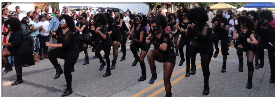
The Camden Sophisticated Sisters perform at PBCIP's Haddon Avenue Street Festival earlier this year.