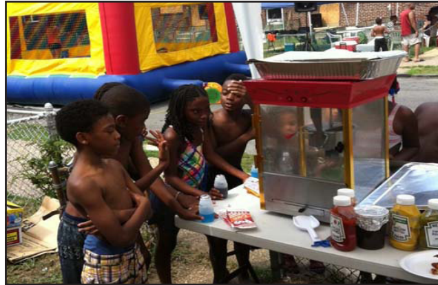
The 1100 block of Kenwood Avenue was just one of several blocks to organize a block party this summer. Did you know you can send your photos from the neighborhood to the PBCIP website? Go to www.pbcip.org and click on Photo Galleries, then Share Your Photos.

Although tea has many health benefits, did you know black, green and some herbal teas can rob your body of iron? Tea should be consumed sparingly and not around meal time so that your body can properly absorb iron. Low iron can cause anemia with symptoms of tiredness and feeling lightheaded. This tip is courtesy of the PBCIP marketing coordinator's pediatrician.