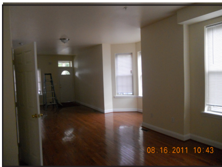
Hardwood floors throughout the first floor add value.

Contact us to make an appointment to stroll through a finished PBCIP home and