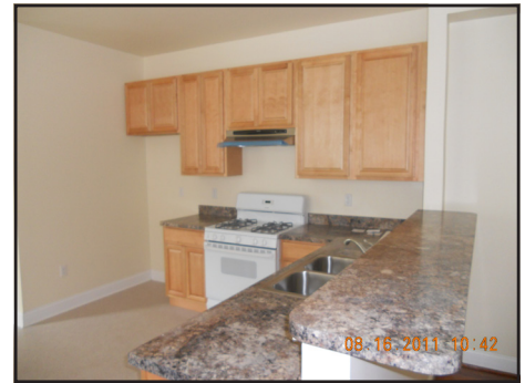
Completely new kitchens are a highlight of PBCIP's homes for sale.

It's like a getting a home for half price! How is this possible? PBCIP constructs the home using funding from the government and charitable foundations that