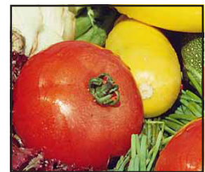
Get Your Fresh Fruits & Veggies While You Can!

The AHEC Farmer's Market at Lourdes Medical Center closes in late October. Meantime, visit every Wednesday between 2 and 5 p.m.